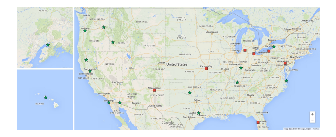
Figure 2: The distribution of contexts (cities) for which our recommender system performs more than 0.1 better (green stars) or worse (red cubes) than averaged median in terms of prec@5.

text, we have conducted a study to see if our recommender system performs better or worse for certain contexts than others in terms of prec@5. In particular, we have found that for our system performed more than 0.1 absolute better than the averaged median for Boise, Walla Walla, College Station, Bloomington, Portland, Redding, San Diego, Virginia Beach, Yuma, Clarksville, Buffalo, Sacramento, Anchorage, Honolulu and Lawton. And for Erie, Lancaster, Kalamazoo, Homosassa Springs, Toledo, Albuquerque and Kansas City, our system performed more than 0.1 absolute worse than median. The above locations have been labelled in figure 2.