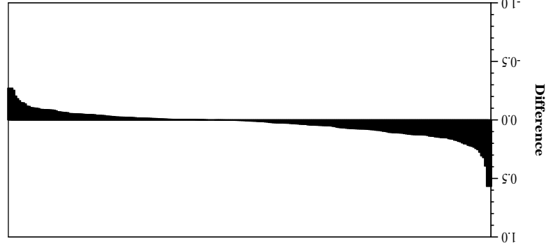
Difference from median in average precision per topic (sorted by difference)