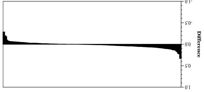
Difference from median in average precision per topic (sorted by difference)