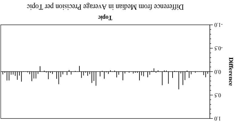
Difference from Median in Average Precision per Topic