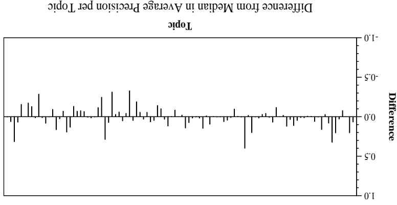
Difference from Median in Average Precision per Topic