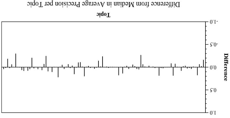
Difference from Median in Average Precision per Topic