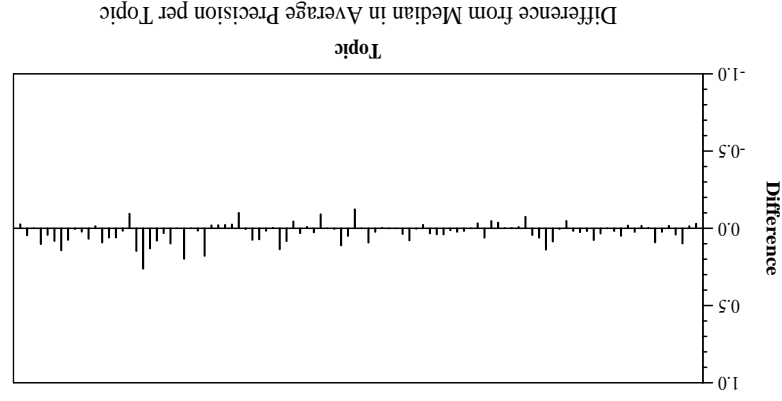
Difference from Median in Average Precision per Topic