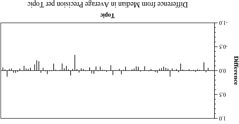
Difference from Median in Average Precision per Topic