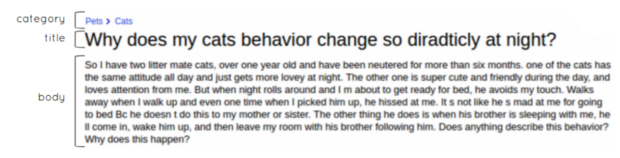
Figure 2: Example of a question from Yahoo! Answers community question answering platform

verbose. Therefore, we use multiple query generation strategies, designed to increase the chances to find a good match: