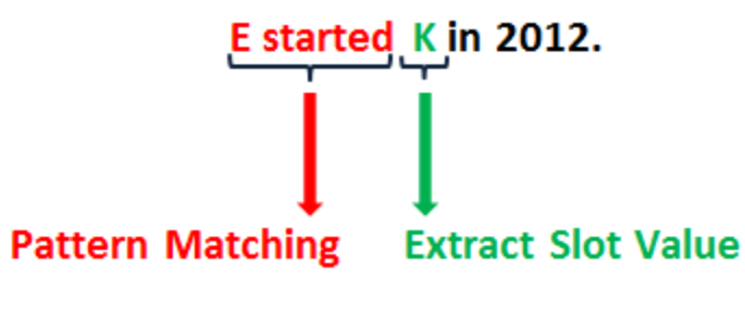
Pattern Matching Method

The basis of our system is using seed patterns to extract the value of every slot name for each entity. For each slot name, we came up with a list of seed patterns. For example, with an entity of type PERSON, a slot name "FoundOf", assuming that person is the founder of company C. Then we expect to find in documents the following sentences: "E started C", "E founded C", "C was founded by E"..., then our seed patterns would be "E started", "E founded", and "was founded by E". Then assuming we found a sentence that contains the seed pattern, for example "E started K in 2012." So we will check the type of the token K. If its type is "ORG", then we can conclude that the PERSON E is the founder of the ORGANIZATION K. And we will update the slot "FoundOf" of the entity E. The slot value would be K.