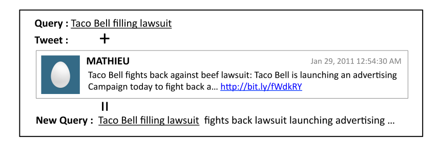
Fig. 2. New query = original query + relevant tweet by user feedback.

detect a relevant tweet without much effort. Finally, we combine the selected tweet with the original query to create a new query for retrieving a new set of tweets. Figure 2 presents an example of the original query ( Taco Bell filling lawsuit ), its relevant tweet, and a new query.