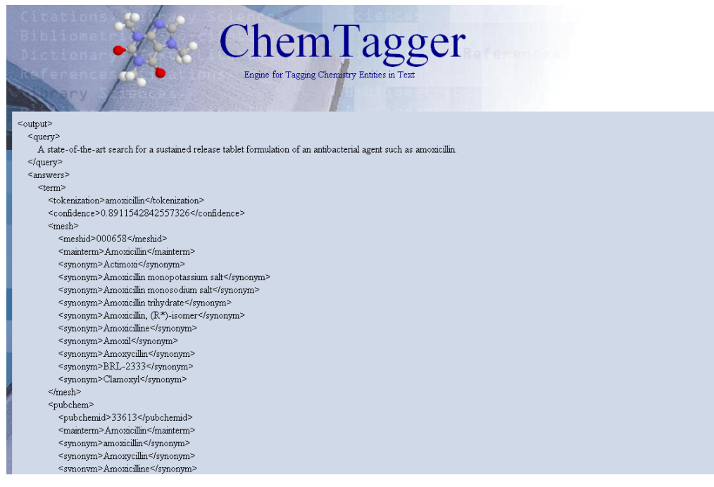
Figure 3. Example of normalization and expansion for the official TREC 2010 query (TS-30) containing chemical named entities such as amoxicillin as recognized by the ChemTagger. Each normalized chemical term is associated with a confidence score depending of its context, a unique identifier (here from MeSH or PubChem) and preferred form with a set of synonyms (e.g. amoxil, clamoxyl...).