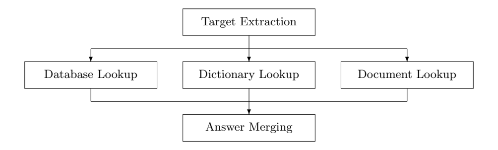
Figure 2: Architecture for answering definition questions.

Our system correctly identifies the question focus as "U.S. state" (corresponding to the target type US STATE) and extracts all instances of U.S. states from top ranking passages. Since the passage retrieval algorithm returns passages that already have occurrences of terms from the question, instances of the target type are likely to be the correct answer.