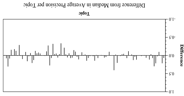
Difference from Median in Average Precision per Topic