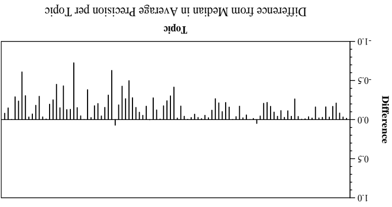
Difference from Median in Average Precision per Topic