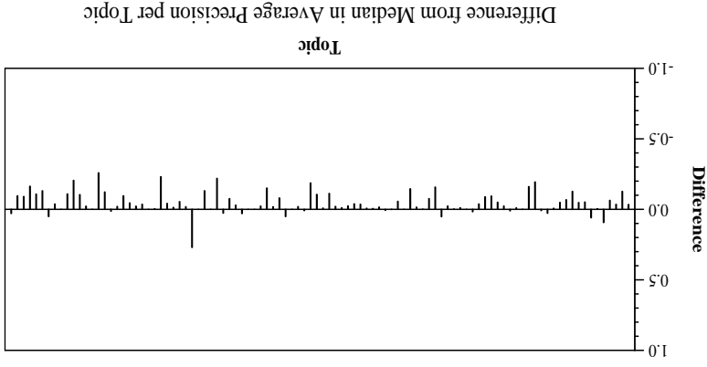
Difference from Median in Average Precision per Topic