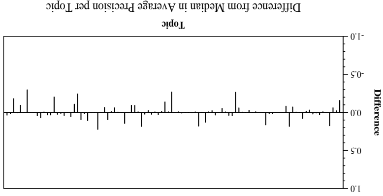
Difference from Median in Average Precision per Topic